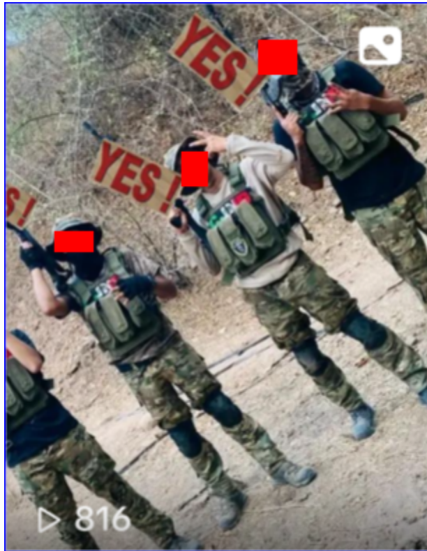
Still from a TikTok video showing a group of masked individuals in coordinated tactical attire, including plate carriers and camouflage, using a "4" hand signal to communicate shared identity and affiliation. (Redactions by Graphika)