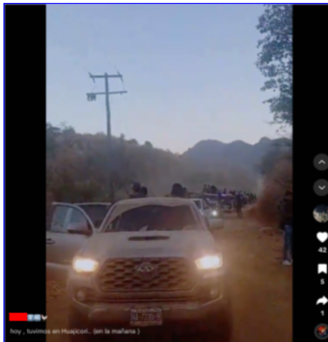
Still from a TikTok video showing a multi-vehicle convoy traveling through a rural area, posted by an account whose username and caption reference "4 NG," alluding to mobility, territory, and identity. (Redaction by Graphika)