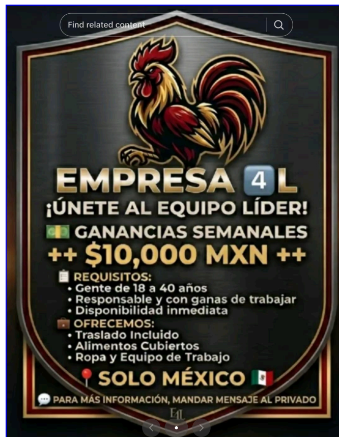
Still from a TikTok video promoting recruitment using “4L” and rooster iconography (associated with the alias of CJNG leader “Nemesio Oseguera Cervantes,” aka Lord of the Roosters) alongside salary incentives, and job-like messaging.