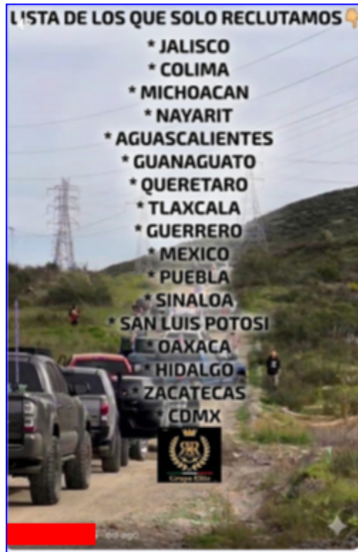
Still from a TikTok video encouraging recruitment by listing targeted states across multiple regions, combined with convoy imagery and group insignia. (Redaction by Graphika)