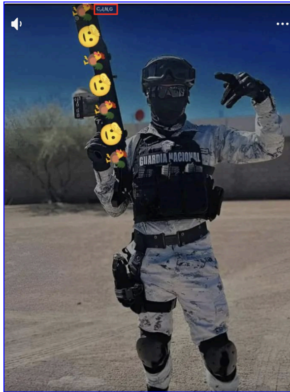
Still from a TikTok video showing a masked individual in tactical gear, with a weapon partially obscured by emojis and a barely visible "CJNG" label embedded at the top of the frame.