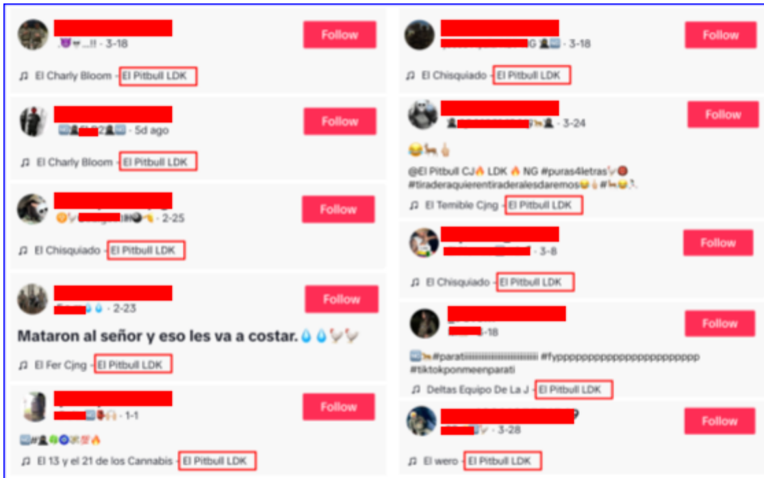
Multiple TikTok posts across different accounts show the use of audio tracks associated with the musical artist El Pitbull LDK, alongside recurring identifiers, such as “NG,” “CJNG,” and “4 letras.” (Redactions by Graphika)